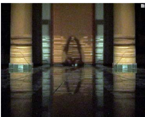
Holta Tola: 'I 2 '

Dritan is designing one hand copying it from a chalk one. When he's finished the work he leaves the drawing behind the chalk hand that unexpectedly starts moving and after having cancelled the Dritan's drawing draw itself in gesture of Victory.