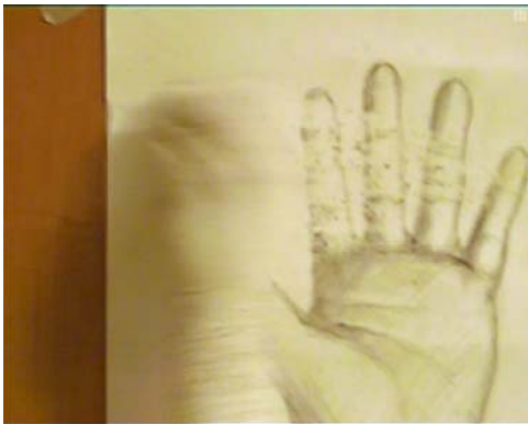
Dritan Hysenai: 'The hand'

In the video the two girls meet themselves, greet themselves and go away, apparently seems do not have nothing in common, but synchronized they complete the same gestures. They found a key in a bush, they approach a house, they enter and they are put on a sofa, with plastic bags on their feet