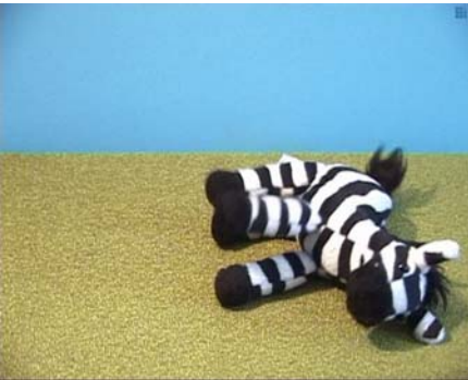
Irgin Sena: 'Ground shaking'

The video images from electoral manifests are associated with the relative voices of the candidates who promise and promise, until disappearing in the image because the manifests are torn and the candidates not more recognizable.