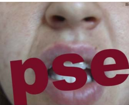
Adela Demetja: 'Pse?' (why?)

A political election billboard shows many persons hand by hand, the music is "go west" like a message of these politicians to integrate Albania in Europe, but when the shoot goes away we notice that the billboard is behind the iron grid of the kiosk, used as a metaphor for the political promises and Albanian reality.